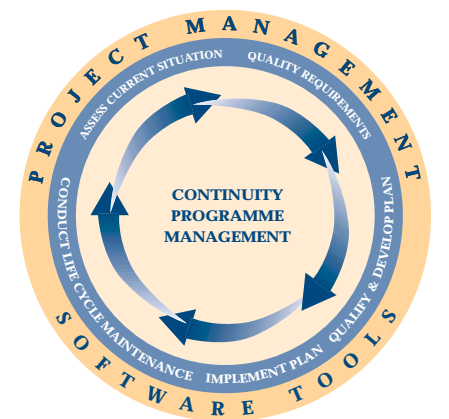
Continuity Programme Management

Our CPM service pulls these elements together by exploiting our extensive knowledge and expertise. The service also provides quality assurance, timely reporting, software tools and continuous programme monitoring and improvement.